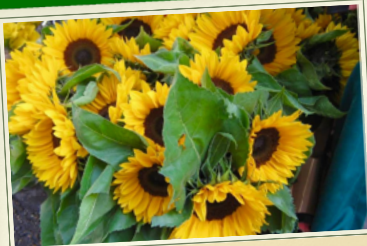
Education in the Garden