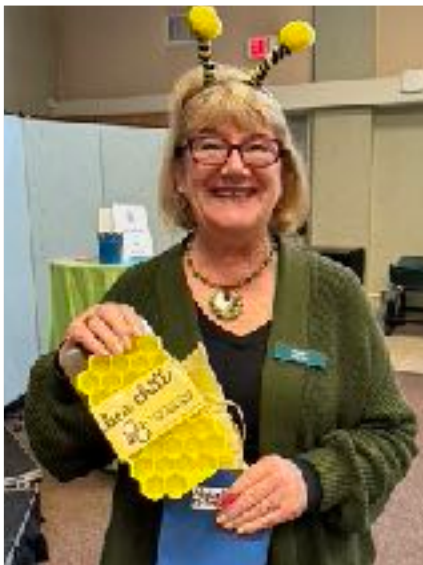
October Newsletter Contest Winner