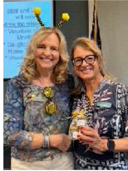
Volunteer of the Month