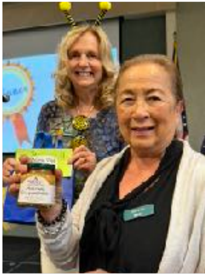
Name Tag Wearer